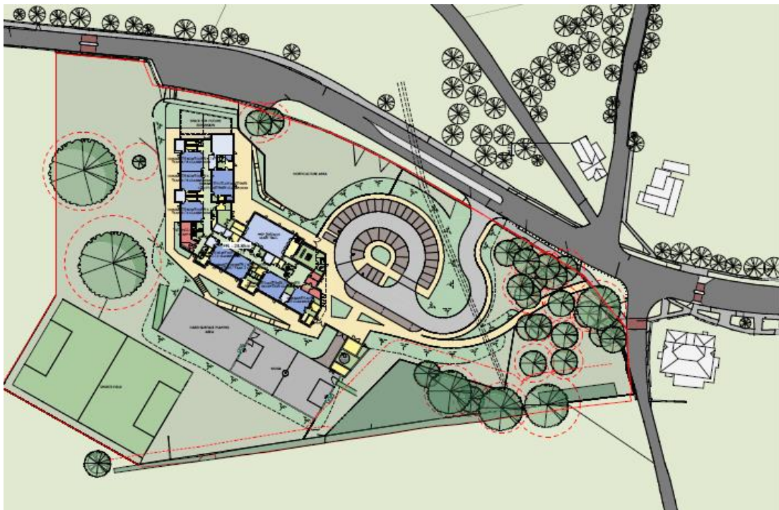
Conceptual site plan

The site is located on the western side of the town of Cricieth.